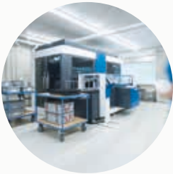
Finishing and cleaning