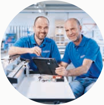
Mechanical and mechatronic systems